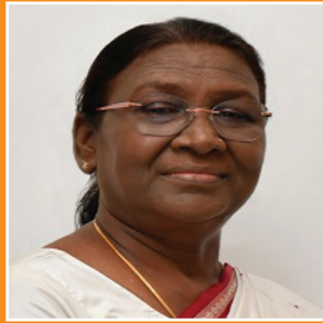
Visitor Smt. Droupadi Murmu Hon'ble President of India